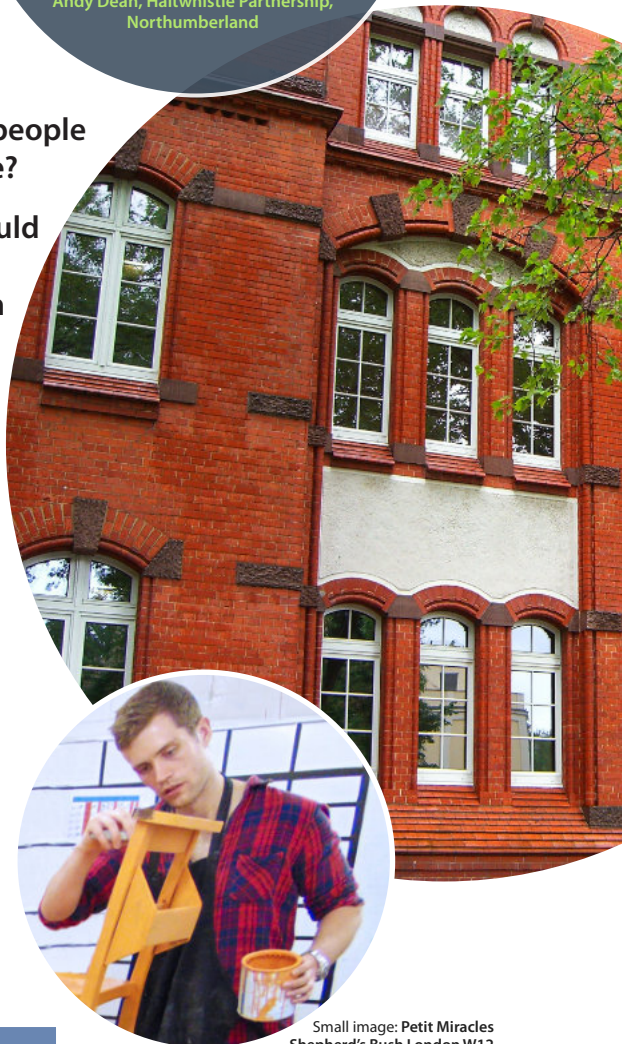
Small image: Petit Miracles Shepherd's Bush London W12 – teaching disadvantaged people how to upcycle furniture

All affordable consultancy income supports our free property advice services for local community groups.