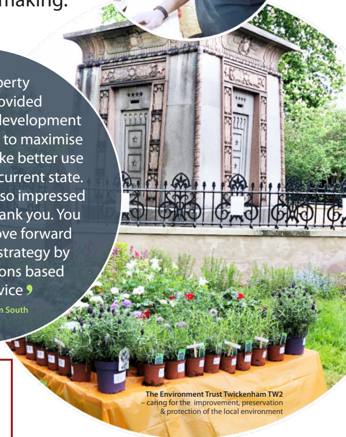
The Environment Trust Twickenham TW2 – caring for the improvement, preservation & protection of the local environment